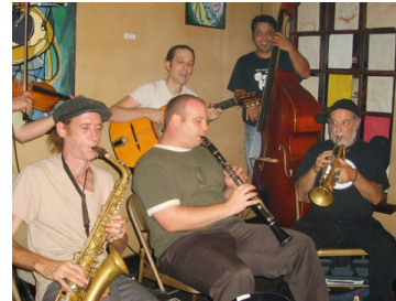
New Orleans Jazz Vipers